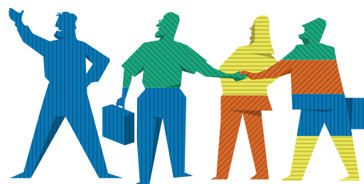
Participants in auctions of multiple interrelated objects – such as radio frequencies in different parts of the country – often want to bid on “packages” of objects. This complicates the auction’s design, especially if the seller wants to stop bidders from colluding to keep prices low.